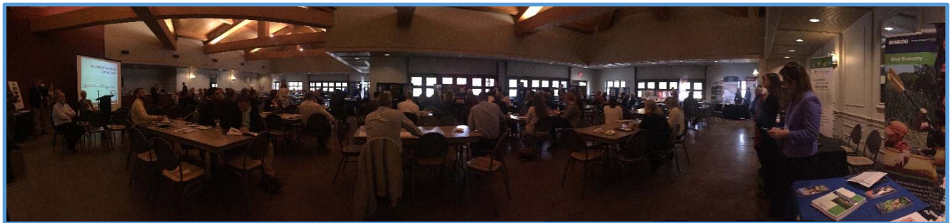
Great Lakes Restoration celebration hosted by the ARC at The Henry Ford

ARC Staff prepared an abstract submissions for the Great Lakes and St. Lawrence Green Infrastructure Conference that is planned for May 2017.